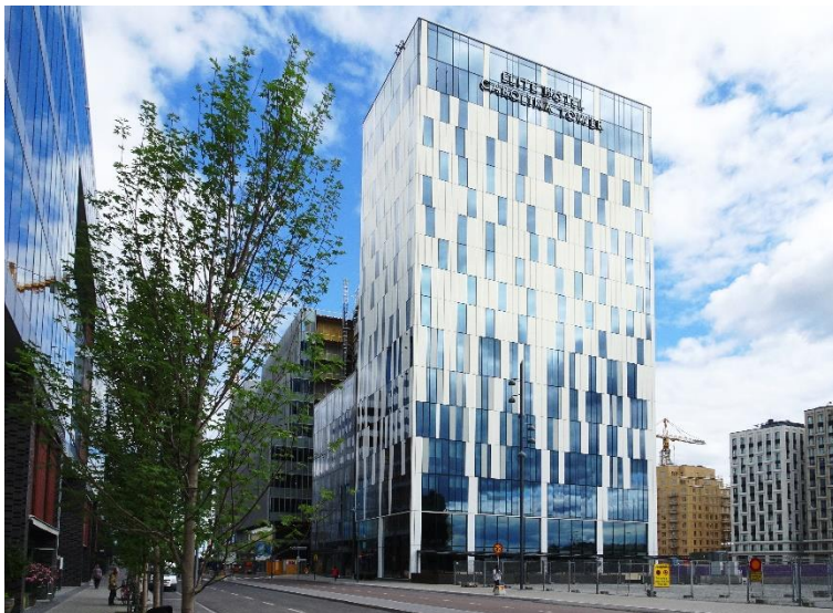
The Carolina Tower Hotel

We will meet in front of the entrance of the Carolina Tower Hotel, Eugeniavägen 6, Solna at 7 am. Please be on time.